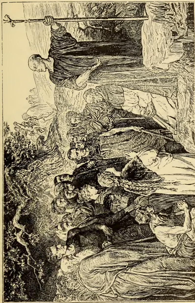
Alfred the Great